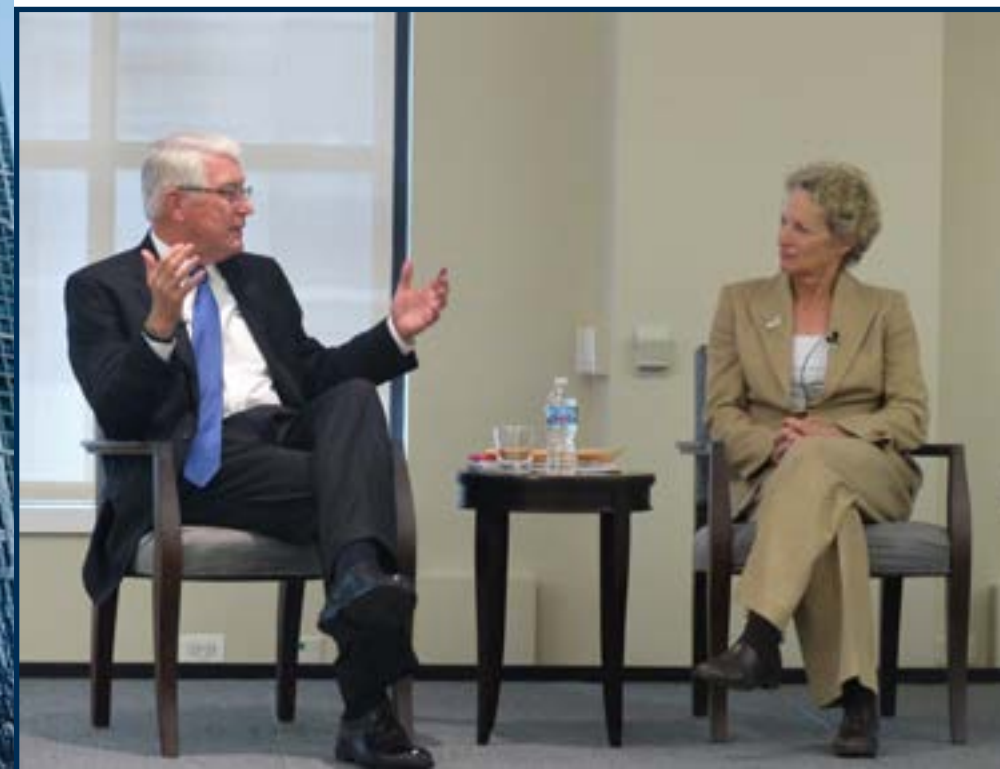
(Top right) U.S. Senator Dick Durbin speaking at the Civic Federation's Annual Meeting