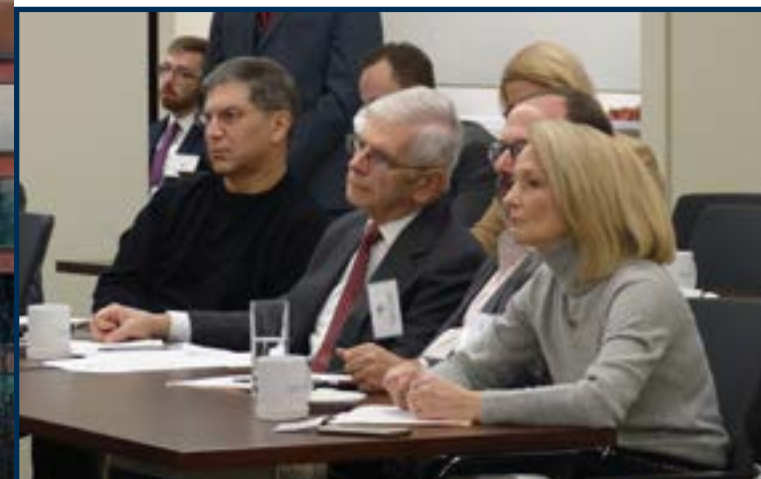
(Left) Civic Federation Trustees, Board and Council members at a Federation Board meeting