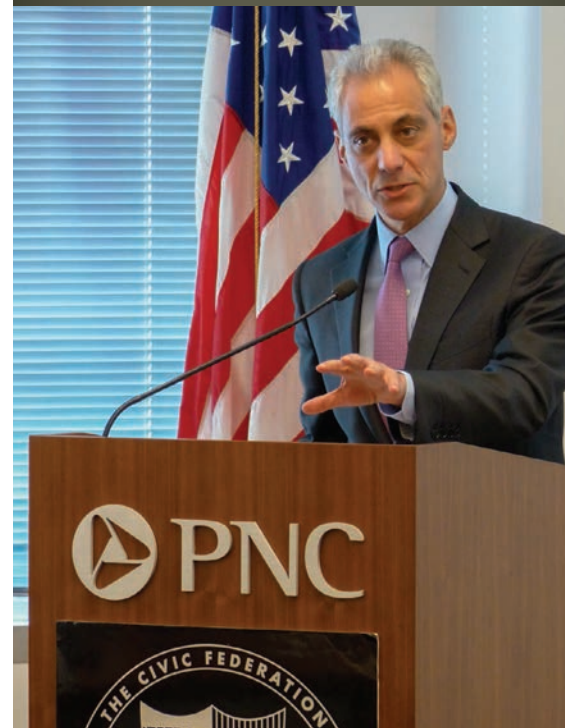
Chicago Mayor Rahm Emanuel addresses the Civic Federation Board of Directors.

The Civic Federation supported the Forest Preserve District of Cook County's proposed $190.3 million budget for being reasonable and balanced, not using fund balance reserves for operations and holding the property tax levy relatively flat at a time when many other local governments have sought large revenue increases. The District's underfunded pensions remain a concern.