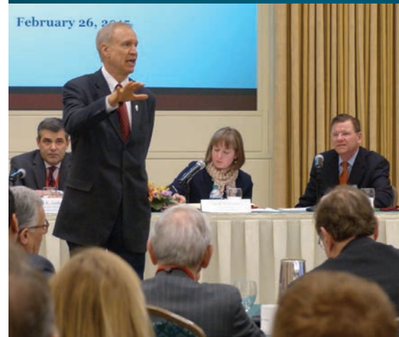
Illinois Governor Bruce Rauner addresses the Civic Federation Board of Directors.

Six full months into the impasse, the State of Illinois closed calendar year 2015 without a comprehensive budget.