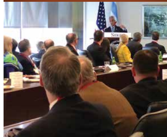
Chicago Mayor Rahm Emanuel addresses the Civic Federation Board of Directors.