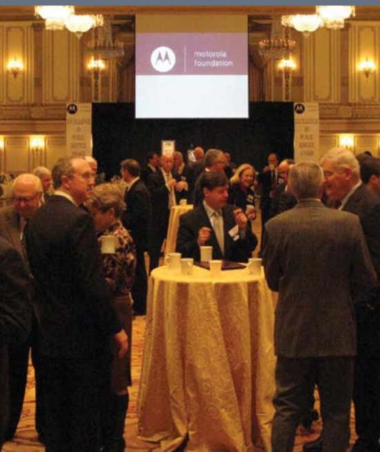
Attendees chat at the coffee reception