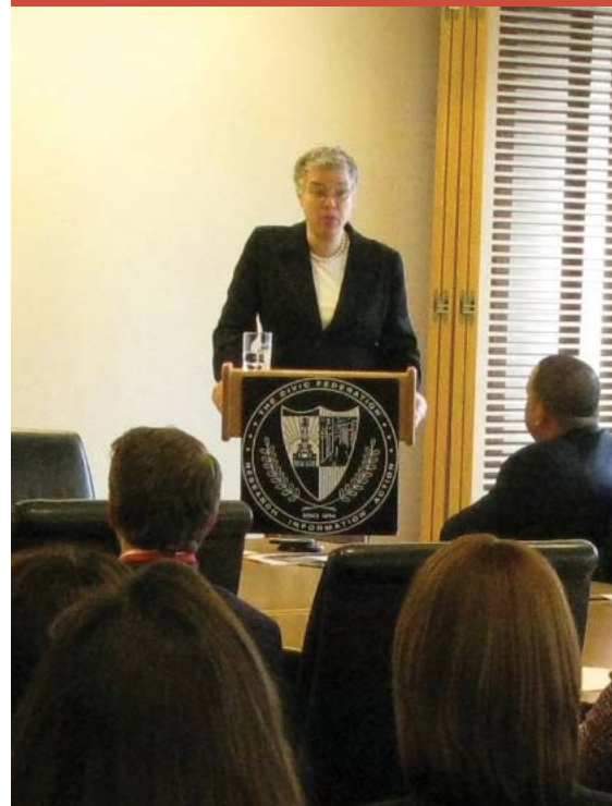
Cook County Board President Toni Preckwinkle shares her perspective on how to reform the County with the Civic Federation Board of Directors