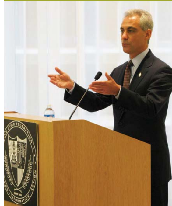
Mayor Rahm Emanuel explains his priorities for the City of Chicago at a Civic Federation Board of Directors meeting