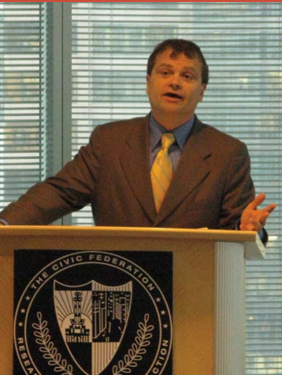
Congressman Mike Quigley at a Civic Federation Board meeting

“The Civic Federation strikes a rare balance among watchdog groups: they critique public policy while still believing in government’s ability to create positive outcomes for citizens.”